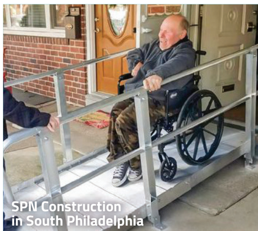
SPN Construction in South Philadelphia

Our Commercial Mortgage Loan , developed for small businesses and nonprofits to purchase their existing locations, supported Black-owned catering company Eatible Delights in funding the purchase of commercial property in Mount Airy, moving expenses, and new equipment.