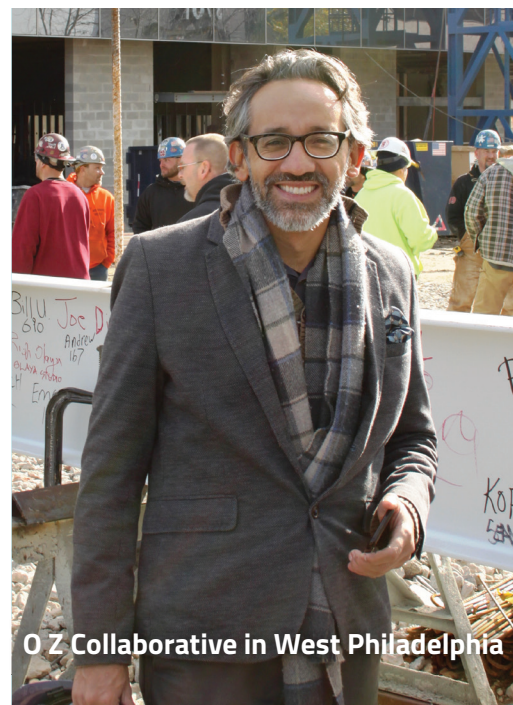
O Z Collaborative in West Philadelphia

held 55 workshops with 1,337 attendees covering topics from project development to mindfulness for entrepreneurs to employment law. In partnership with nonprofit Clarifi, PIDC held its second year of PIDC/Clarifi Boot Camp —a financial coaching and credit counseling program for entrepreneurs — with a cohort of 30 . PIDC also continued its partnership with Your Outsourced CFO in which 10 PIDC clients received one-on-one financial consultation. Plus, PIDC held a variety of EXELs (Executive Leadership Series) forums with 30 CEO participants .