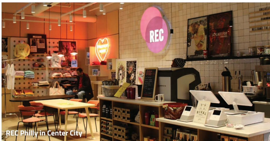
REC Philly in Center City