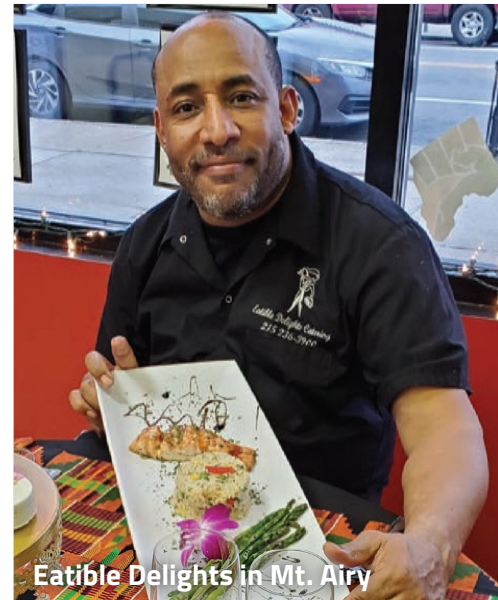
Eatible Delights in Mt. Airy

PIDC supports businesses and nonprofits undertaking capital projects such as building acquisition, renovation, leasehold improvements or equipment purchases that need additional financing to complete the project. O Z Collaborative , an immigrant-owned architectural design company, used PIDC funds to acquire and renovate property for a West Philadelphia architectural studio. Woman-owned brewery Triple Bottom Brewing was able to open a neighborhood brewery with a