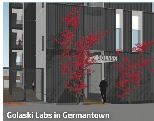
Golaski Labs in Germantown