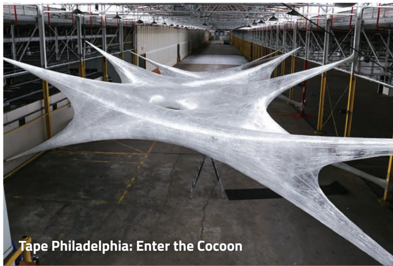
Tape Philadelphia: Enter the Cocoon