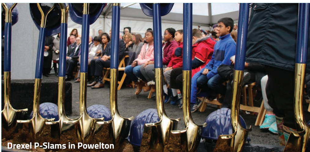
Drexel P-Slams in Powelton