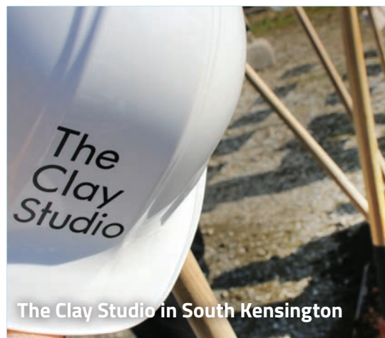
The Clay Studio in South Kensington

In 2019, PIDC completed approximately $312 million in tax-exempt bonds for nine entities, which included charter schools, nonprofit organizations, and the City of Philadelphia. PIDC also administered 62 grants totaling $124 million for stormwater and capital projects.