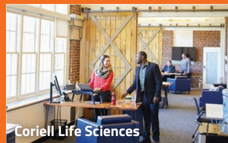
Coriell Life Sciences