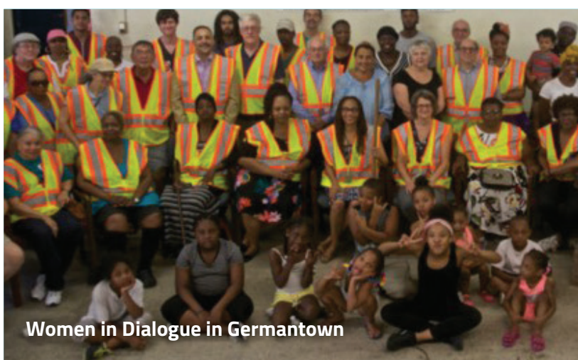
Women in Dialogue in Germantown