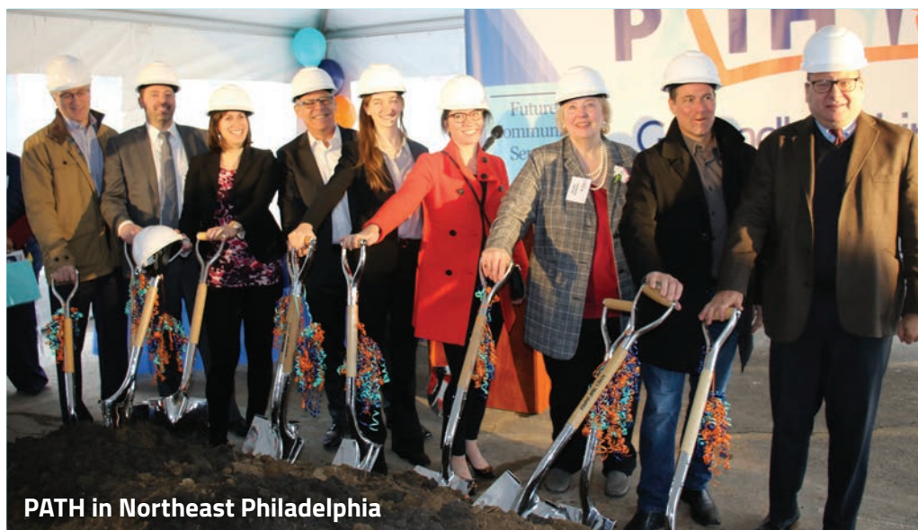
PATH in Northeast Philadelphia