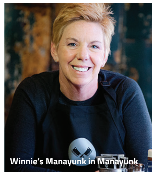
Winnie's Manayunk in Manayunk