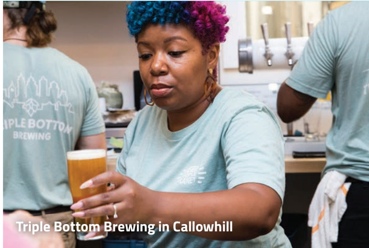
Triple Bottom Brewing in Callowhill

PIDC supports early stage entrepreneurs with Ben Franklin Technology Partners as the investment fund manager for StartupPHL Seed Fund II . In 2019, the fund made 24 investments for a total of $420K within the physical science, IT, and health/digital health sectors, 50% of which were minority and/ or women-led businesses.